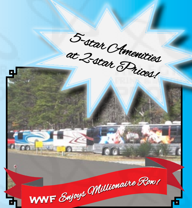
WWF Enjoys Millionaire Row!

*Electricity metered and billed monthly Price Subject to change. 13% Lodging Tax applies to all cottages staying less than 90 days. Group and Membership discounts available on RV sites.