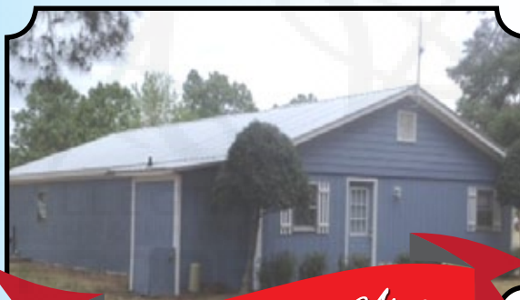
Clubhouse & Rally Area