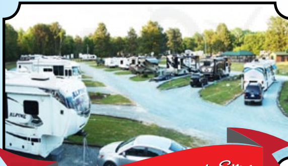
Huge Level Pull Through Sites

Ask about our special rates for Groups, Rallies, Reunions and Military Families!