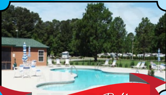
One of our Two Pools