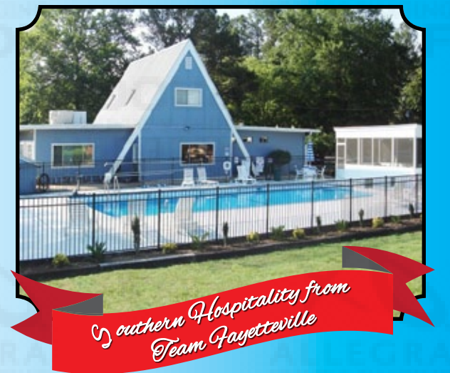
Southern Hospitality from Team Fayetteville

At Fayetteville RV Resort & Cottages, our team will escort you to your site to confirm everything is ship-shape. Whether you need help with our free cable or advice on wonderful day trips and antiquing, our welcoming team is committed to providing great service and warm, Southern hospitality. You may come as a stranger, but you will certainly leave as a friend and honored guest with our hopes you will return.